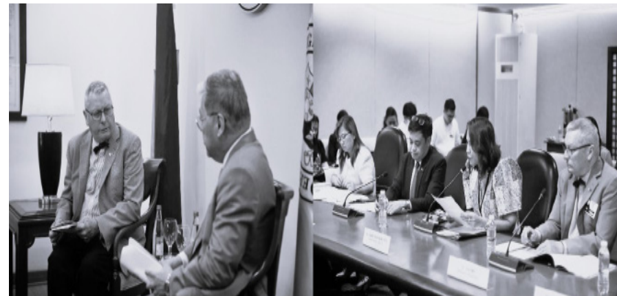
IN PHOTO: (left) SR Ian Fry during his courtesy call on Secretary for Foreign Affairs Enrique Manalo (right) Representatives from various PH government agencies during an entry conference with SR Ian Fry

Prior to his meetings with the members of Cabinet, the Special Rapporteur held an extensive dialogue with senior representatives of the Department of Environment and Natural Resources (DENR), Department of Social Welfare and Development (DSWD), Department of Justice (DOJ), National Commission on Indigenous Peoples (NCIP), and the Philippine Commission on Women (PCW) who led the discussions on (1) loss and damage; (2) climate change displacement; (3) climate change litigation and intergenerational justice; (4) climate change and the protection of environmen-